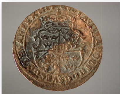
Rundmynt - Vasamuseum, Sweden - CC BY-SA.