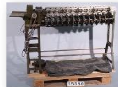
Kortsorteringsmaskin by Powers Accounting Machine Corp Ltd - Swedish National Museum of Science and Technology, Sweden - CC BY.